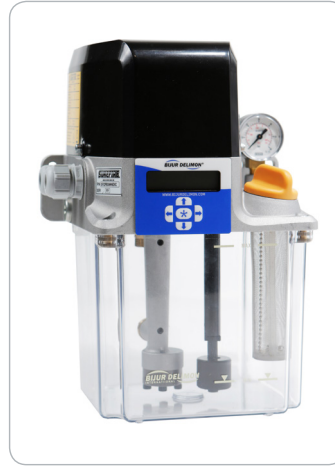
SureFire II with Controller