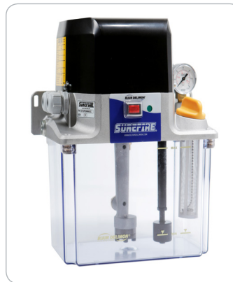
SureFire II with no Controller