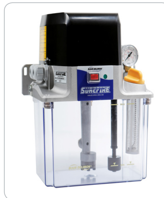
SureFire II with no Controller