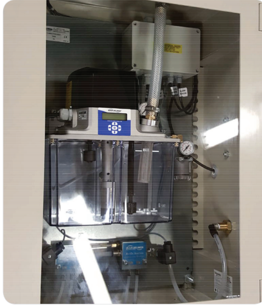
Air/Oil System in Enclosure