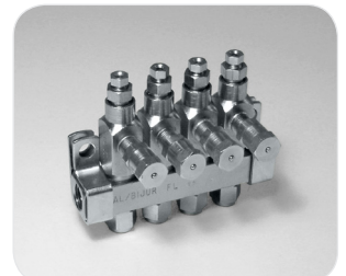
FL Injectors (Available in SS)