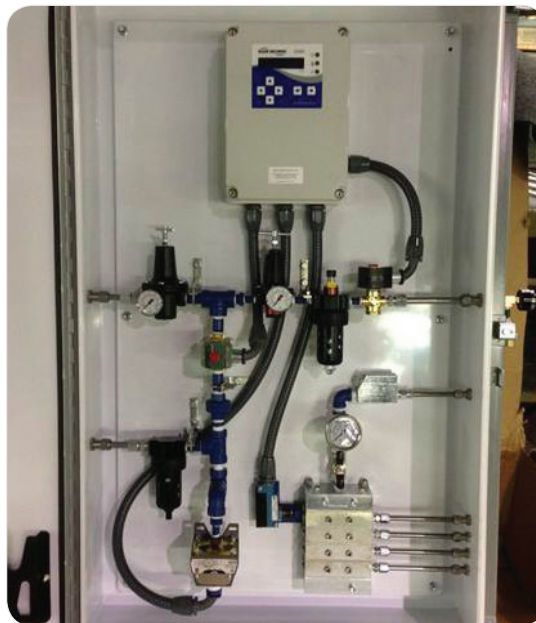
Automatic Grease System in Enclosure