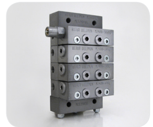
M2500G Block Standard with Zinc Nickel Coating (Optional SS Available)