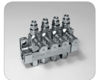
FL Injectors (Available in SS)