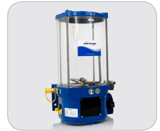
Dynamis Maxx with Controller