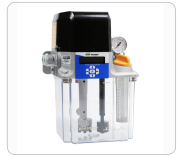
SureFire II with Controller